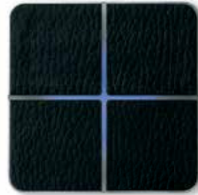
0204-13 black leather