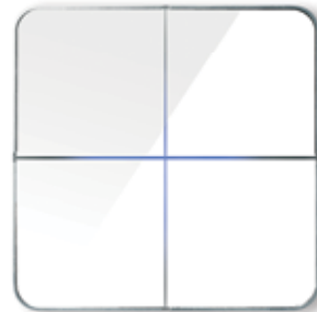
0204-04 white glass