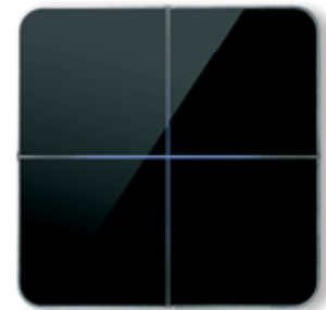
0204-03 black glass