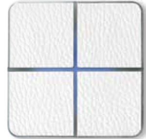
0204-14 white leather