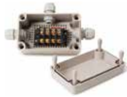
The supplied IE1 direct burial junction box makes wiring simple and secure