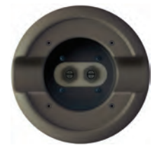
Double connectors make daisy chain wiring easy

On the underside of the NEAR IG4M satellite enclosure are two IP-67 rated “Perfect Fit” connectors that allow convenient daisy chain wiring of multiple speakers on a single line. The supplied connector socket and plugs are keyed to prevent wiring polarity errors while their double O-ring design prevents ingress of water and dirt for long term signal integrity. Installing the system is fast, efficient and super easy. The system includes one IE1 direct burial junction box and four 20-foot direct burial speaker cables pre-terminated with “Perfect Fit” connectors. The supplied accessories greatly simplify wiring hookup and ensure long-term signal connection integrity.